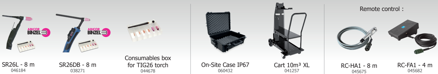
SR26L - 8 m 046184