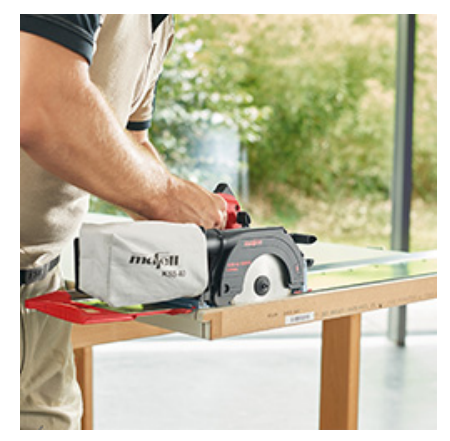
In combination with the roll-up Flexi-Guide FX 140, precise guided cuts up to 1.4 m (4.6 ft) long can be executed with consummate ease.