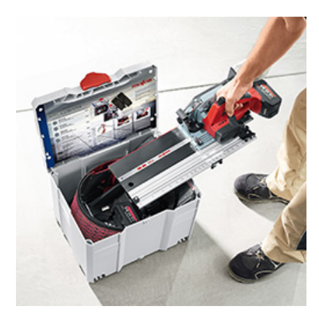
One system, five saws, one case: the KSS 40 can be used as a cross-cut saw, plunge-cut saw, shadow gap saw or portable circular saw with or without the Flexi-Guide FX 140 for extra guidance when cutting.