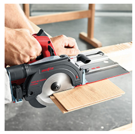
Fastening the portable circular saw to the KSS rail creates a very practical single-handed crosscutting system.