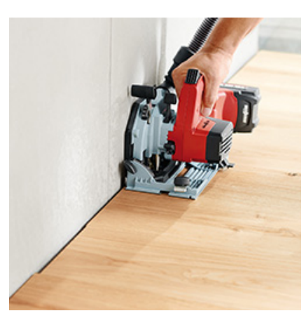
Perfect edging: the circular saw's spacers enable you easily to make exact expansion joint cuts with widths from 13 mm (1/2 in.).