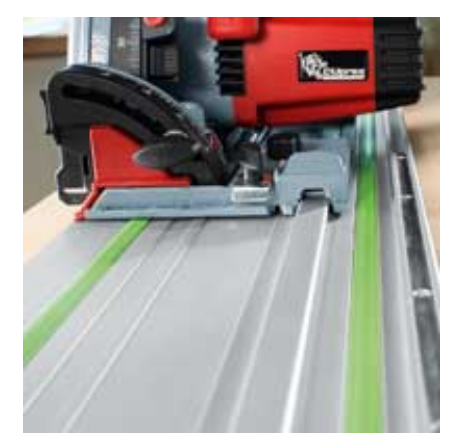
The saw is easy to use on other track systems as well.