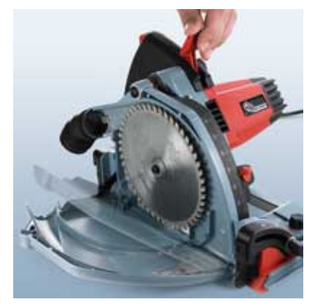
MAFELL offers the fastest blade change worldwide. Simply press release button and lift lever. Housing opens and allows you to change the blade in a matter of seconds, without any risk of damaging the teeth.