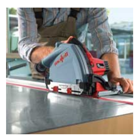
The MT 55 cc comes into its own, for example, when executing highprecision plunge cuts in kitchen worktops.