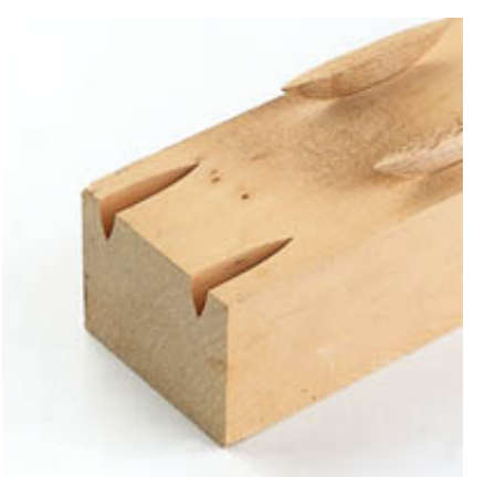
Available as a special accessory for the LNF 20: Pitch pocket cutter, Ref. No. 091793