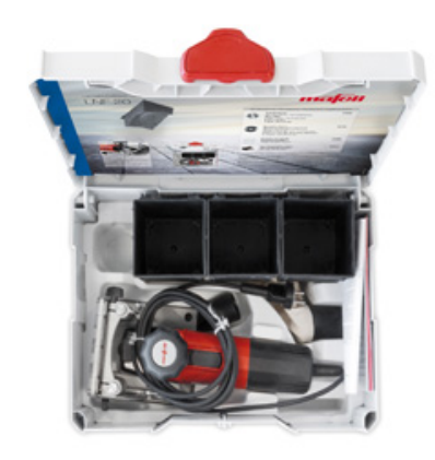
The LNF 20 is supplied in the practical T-MAX.