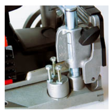
Groove height adjustment via revolving depth control turret or via scale.